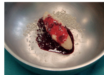
^ Activagen mouldable paste combined with cancellous chips and autologous bone marrow concentrate.