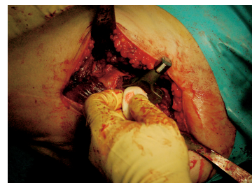
Biocollagen crunch covering the proximal part of a revision femoral stem which is excessively exposed because of the huge loss of bone substance.